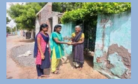
On 25 <sup>th</sup> March 2022 Department of Psychology organized an Awareness program on "Women's Health and Menstrual Hygiene". The participants included students and staffs along with the people of Ramdoss nagar, especially girl children and women.